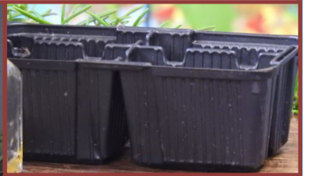
Seeds need sun water and soil.