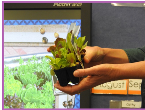
Seedlings are baby plants ready to plant in the veggie patch.